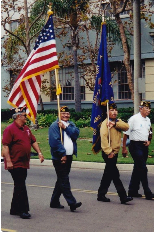
Veterans Day Parade.